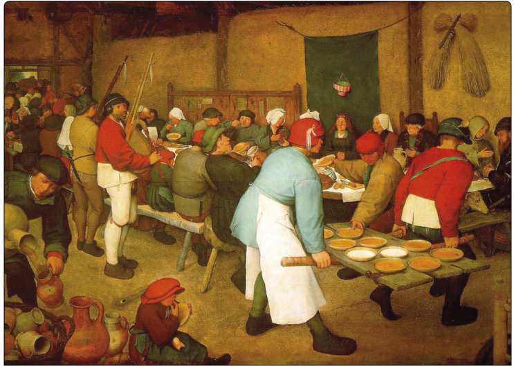
The Great Banquet in the Kingdom of God will be greater than anything we can imagine here on earth. Pieter Breugel the Younger, "The Peasant Wedding Banquet" (1568), Kunsthistorisches Museum, Vienna.

I take this opportunity to thank all those missionaries who, in response to Christ’s call, have left everything behind to go far from their homeland and bring the Good News to places where people have not yet received it, or received it only recently. Dear friends, your generous dedication is a tangible expression of your commitment to the mission ad gentes that Jesus entrusted